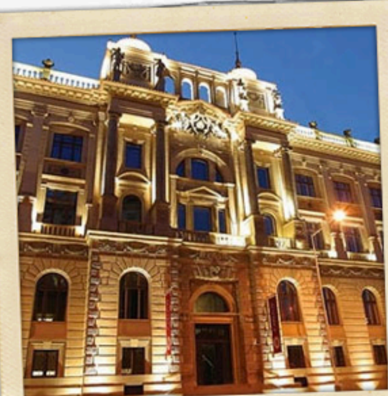
Boscolo Prague Luxury You Can 'Bank' On