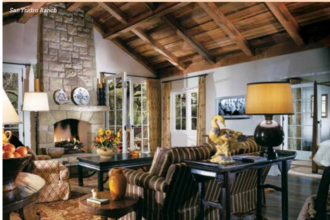
San Ysidro Ranch

LA's modern take on traditional Thai served up in a grand space. 518 West Seventh Street Tel: +1 (213) 537 0333 www.soi7la.com