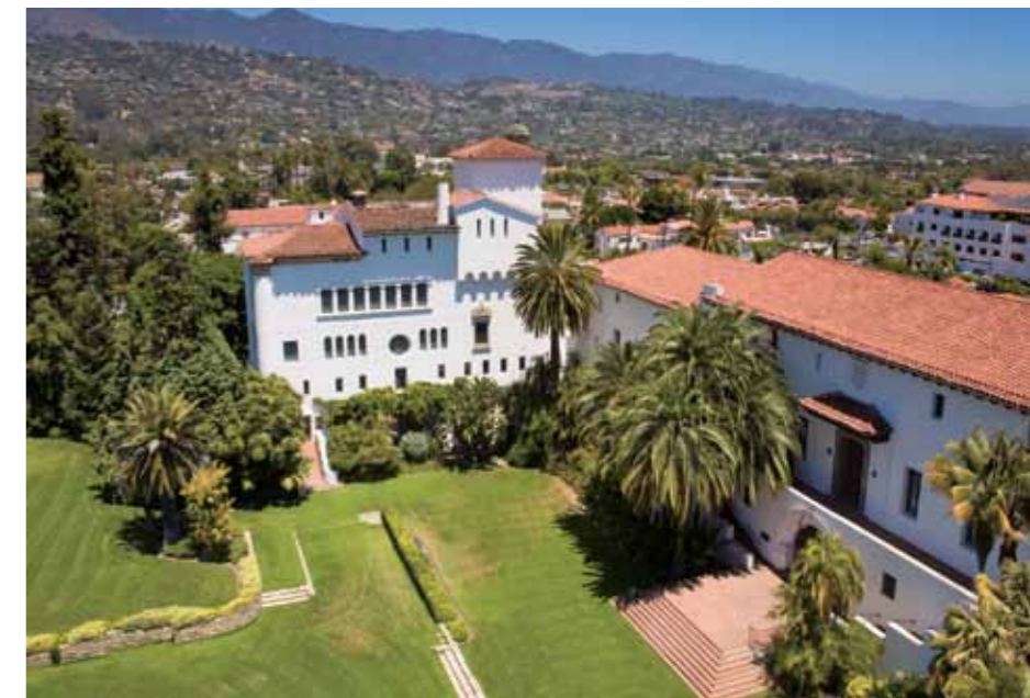
Above: The Santa Barbara County Courthouse, one of Southern California's famed iconic structures. Below: The Joshua Tree National Park's breathtaking desert landscape.

For a real taste of the west, head to San Ysidro Ranch, an exquisite lodging option featuring private cottages and suites. John F Kennedy honeymooned here and it's easy to see why from the minute you turn into its long and stately driveway lined with olive trees. All rooms feature fireplaces, with suites and free-standing cottages offering outdoor hot tubs and rain showers on private patios.