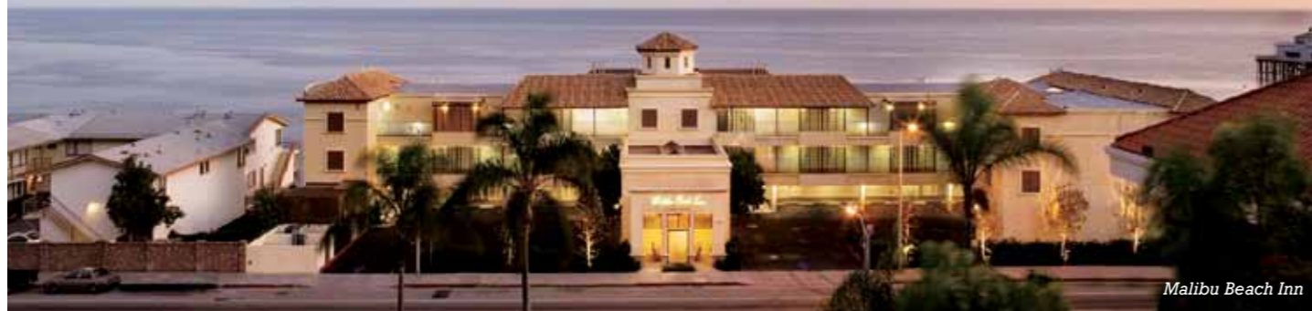
Malibu Beach Inn

From cocktails in a bowling alley to a fine chardonnay enjoyed while gazing over the Pacific, Los Angeles and its environs offer visitors an exquisite experience.