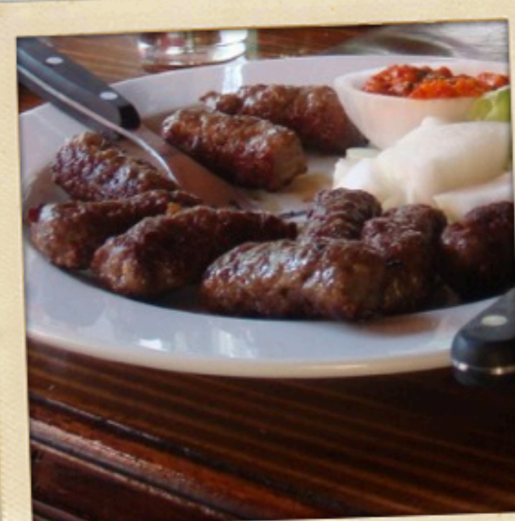
Ćevapčići Small Bites With Big Flavour