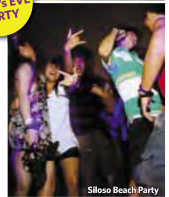
Siloso Beach Party