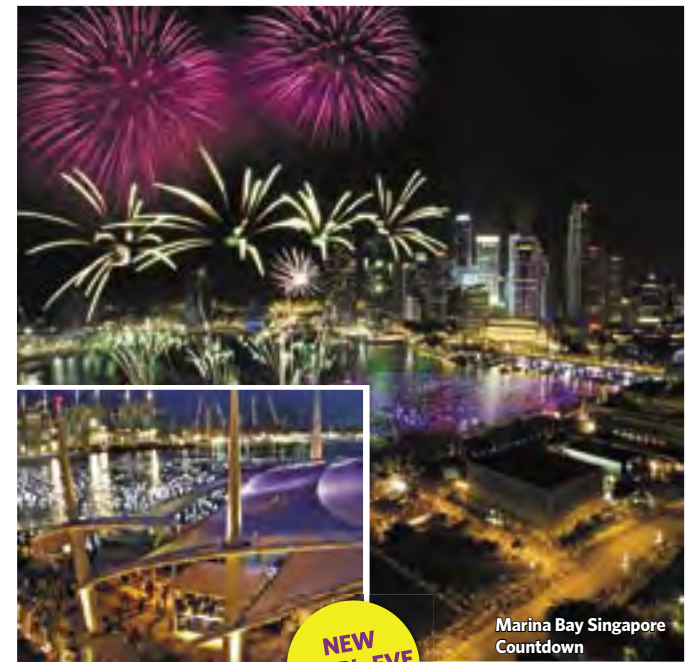
Marina Bay Singapore Countdown

For prime views of this extravaganza, and of course, the rip-roaring fireworks thereafter book into one of the numerous 5-star hotel in the vicinity. www.marinabaycountdownparty.com