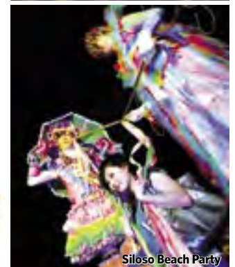
Siloso Beach Party